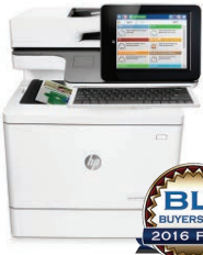
HP Inc. Color LaserJet Pro MFP M577 Series Outstanding Colour MFP for Large Workgroups