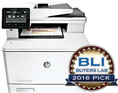
HP Inc. Color LaserJet Pro MFP M477 Series Outstanding Colour MFP for Small Workgroups