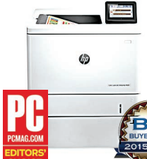
HP CLJ Enterprise M553 series