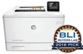
HP Inc. Color LaserJet Pro MFP M452 Series Outstanding Colour MFP for Small Workgroups