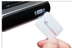
Unlock with RFID token (Optional RFID 2-factor authentication)

Military grade encryption. Absolute convenience. Together in the palm of your hand.