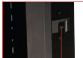
Stud-locating tabs adjust 1/4" left or right to accommodate stud spacing