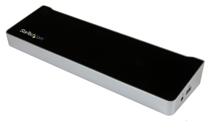
*actual product may vary from photos

FR: Guide de l'utilisateur - fr.startech.com