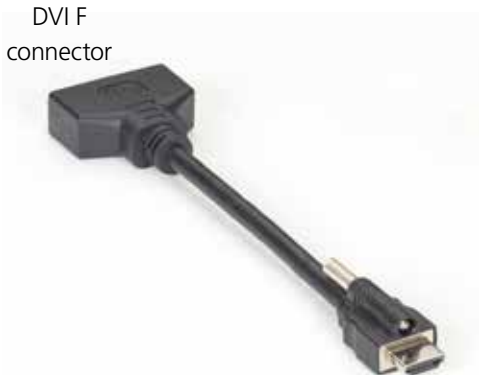
DVI F connector