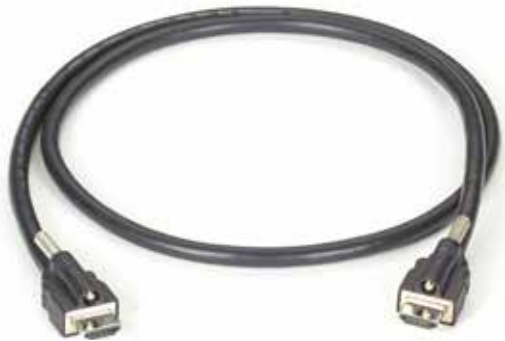
Locking HDMI M connector