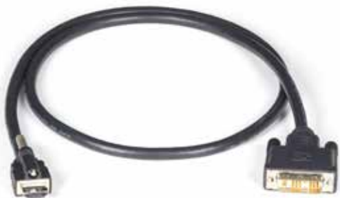
Locking HDMI M connector