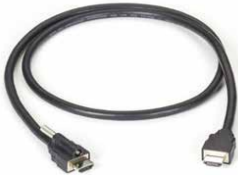
Locking HDMI M connector