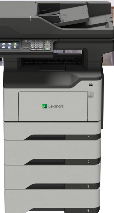
MX522adhe with optional trays