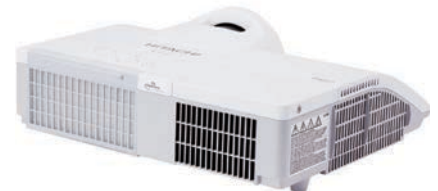
Back 3/4 View