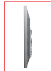
Ultra-slim design holds screen 1.83" from the wall