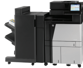
3-bin Stapler/stacker with output (A2W80A)