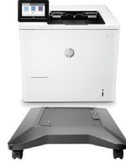
Printer stand (LOH19A)