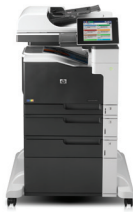
1x500-sheet feeder, cabinet, and stand (CE792A)