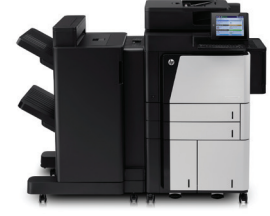
Stapler/stacker finisher with 2/3 hole punch (CZ995A)