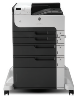
1x500-sheet feeder, cabinet, and stand (CF243A)