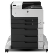
3,500-sheet high-capacity input tray and stand (CF245A)