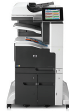
3,500-sheet high-capacity input tray and stand (CF305A)