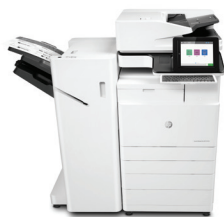
Stapler/stacker finisher (Y1G18A) 4