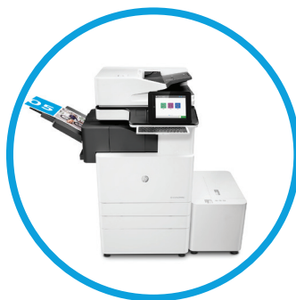
LaserJet with Inner finisher, High-capacity input tray, High-capacity side input tray