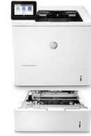
Envelope feeder (LOH21A)