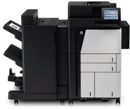
500-sheet Output catch tray (T0F27A)

The following accessories are compatible with the HP LaserJet Managed Flow MFP M830zm.