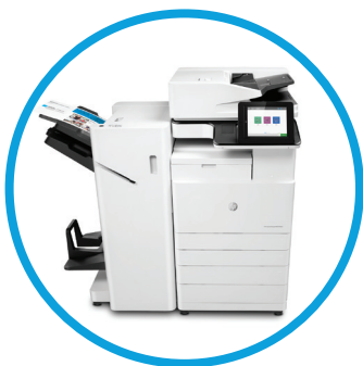
LaserJet with Booklet finisher, Dual cassette feeder