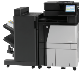
Booklet finisher with 2/3 hole punch (A2W84A)