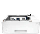
1x550-sheet paper tray (F2A72A)

The following accessories are compatible with the HP LaserJet Managed E50145 and the HP LaserJet Managed MFP E52645 series.