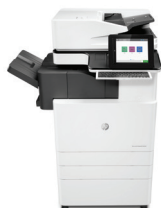
Inner finisher (Y1G00A) 3

The following accessories are compatible with the HP LaserJet Managed MFP E72425, MFP E72430, MFP E72525, MFP E72530, MFP E72535, MFP E82540, MFP E82550, MFP E82560; HP Color LaserJet Managed MFP E77422, MFP E77428, MFP E77822, MFP E77825, MFP E77830, MFP E87640, MFP E87650, and MFP E87660.