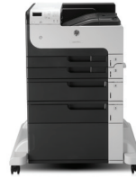
3x500-sheet feeder and stand (CF242A)