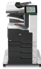
3x500-sheet feeder and stand (CE725A)