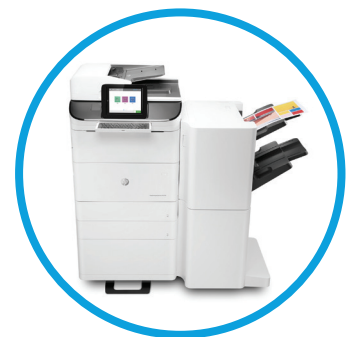
PageWide with 3x550-sheet paper tray and stand, 3,250-sheet external finisher