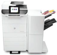
External finisher (Z4L04A)

The following accessory is required (and must be purchased separately) for the HP PageWide Managed Color Flow MFP E77650z+ and Flow MFP E77660z+.