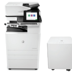
High-capacity side input tray (Y1G20A)