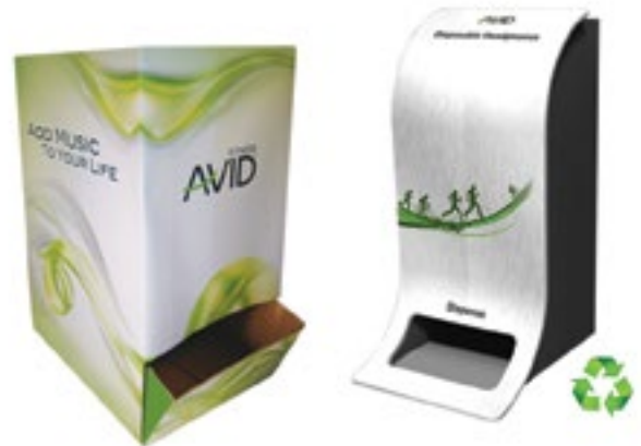
Disposable Earbuds Recycle Programs