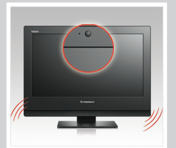
BETTER COLLABORATION Enhanced VoIP experience with optimized 720p HD camera, digital microphone with Noise-Cancelling, and high-quality stereo speakers