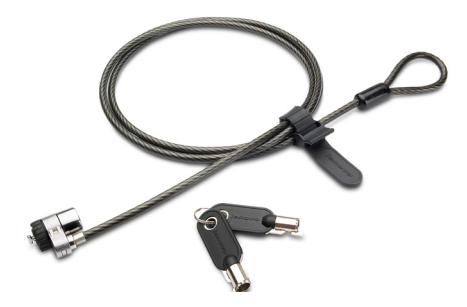
Kensington® MicroSaver Security Cable Lock by Lenovo®

Lenovo® Ultraslim Wireless Keyboard and Mouse combo