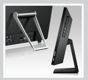
HIGH ON FLEXIBILITY Multiple stand options for flexibility of use in any environment

With superior design and performance, the Lenovo® ThinkCentre® E73z All-in-One (AIO) is the edge that you've been waiting for. Designed to conserve space, the E73z is perfect for small offices, educational instituions, or anyone working in public sector.