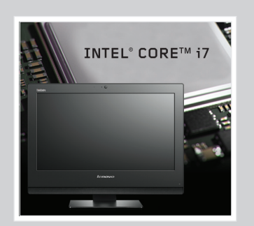
ENHANCED PERFORMANCE Up to Intel® Core™ i7 and desktop-class H81 chipset provides 10% CPU enhancement