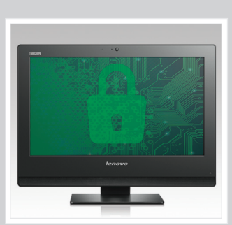
IRONCLAD SECURITY ThinkVantage® Software, PC Auto Lock Utility, Hardware Password Manager, Rescue and Recovery® and USB Port Disable in BIOS