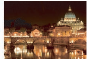
Dynamic Contrast Ratio