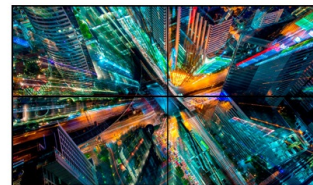
Ultra Slim Line

IPS technology offers higher contrast, darker blacks and much better viewing angles than standard TN technology. The screen will look good no matter what angle you look at it.