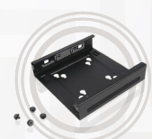
ThinkCentre Tiny VESA Mount II