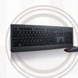
Lenovo Professional Wireless Keyboard & Mouse Combo