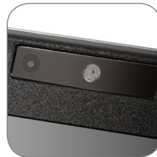
▶ 0.3 Megapixel web camera