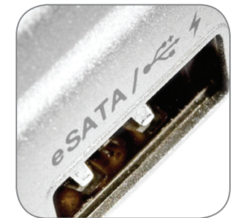
▶ USB Sleep-and-Charge/eSATA port