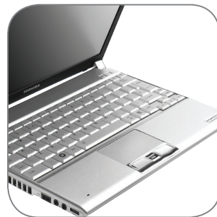
▶ The lightest fully featured laptop in the world*