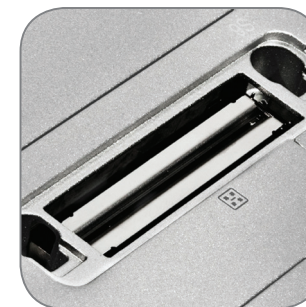
▶ Easy docking