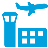
Airport Terminal Wi-Fi

A mobile team traveling to a customer meeting has one of their portable devices loaded with a WWAN card.