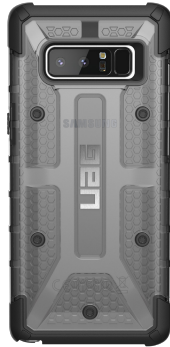
ASH (GREY TRANSPARENT)