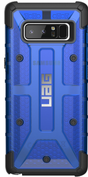
COBALT (BLUE TRANSPARENT)