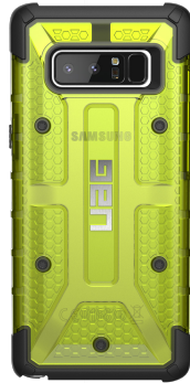
CITRON (YELLOW TRANSPARENT)