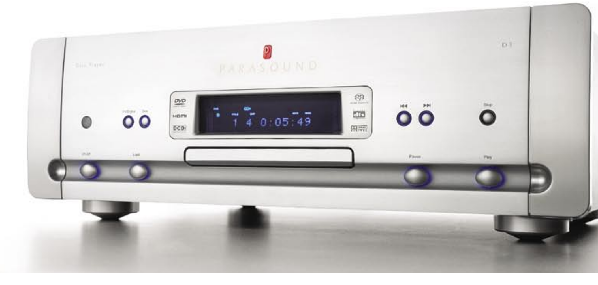
2007 Product Line