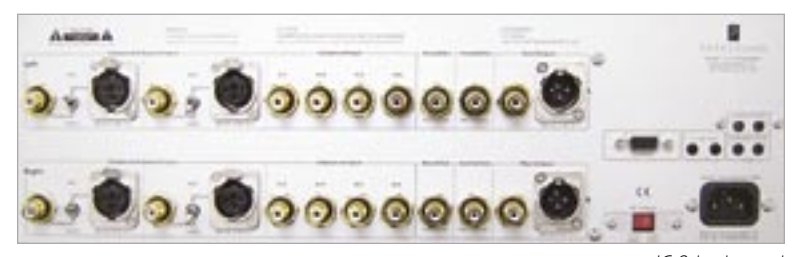
IC 2 back panel

The new Halo |C 2 is a pure analog preamplifier that is the product of pure genius. John Curl's CTC Builders, creators of our famed IC 1, designed the IC 2 to be our next legend. We reach an amazing 116dB s/n ratio by isolating its dual-mono audio circuits behind 3/8" thick shields. Balanced inputs and outputs, switchable polarity invert and full remote control are only part of the luxury of owning a Halo JC 2.