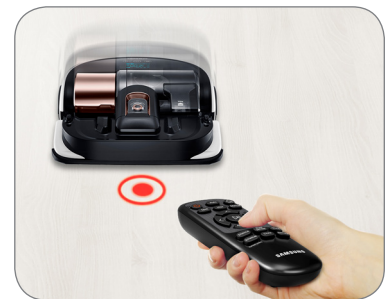
Point Cleaning™ - Allows on-demand vacuum cleaning