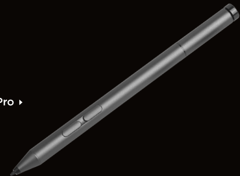
ThinkPad Pen Pro ▶