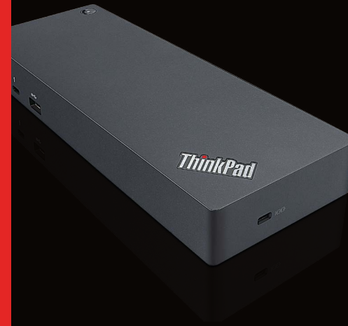
◀ ThinkPad Thunderbolt 3 Dock