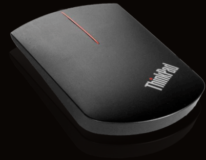
ThinkPad X1 Wireless ▶ Touch Mouse