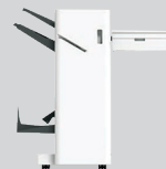
Booklet finisher with optional hole punch