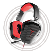
Lenovo Y Gaming Stereo Headset

* Example of Lenovo Legion catalogue naming convention