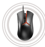
Lenovo Y Gaming Optical Mouse