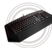
Lenovo Y Gaming Mechanical Switch Keyboard