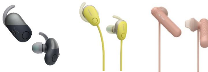
From L-R: WF-SP700N, WI-SP600N and the WI-SP500