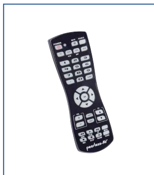
Waterproof Universal Remote

IPS PANEL Provides exceptional picture quality from any angle