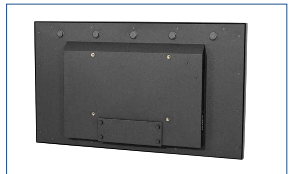
Sealed cable entry helps prevent water and debris from getting inside