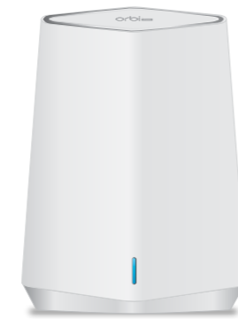
Orbi Pro WiFi 6 Mini Satellite (Model SXS30)

Note: Both devices are included in the SXX30, SXX30B3, SXX30B4, or can be purchased separately.