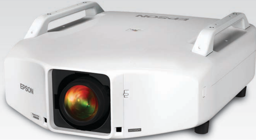
Projector shown with lens. Lens sold separately.