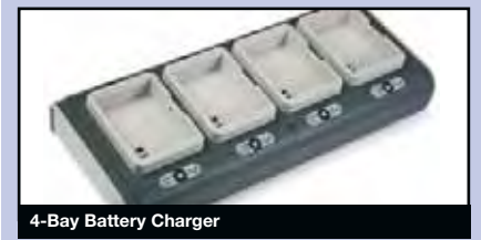
4-Bay Battery Charger