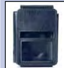
Carrying Case for SM-S200