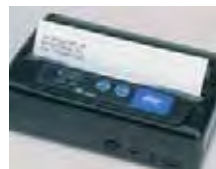
Wide 112mm Paper Width

Wide, 104mm output for data filled service reports, delivery notes or law enforcement parking or motoring tickets in a compact case