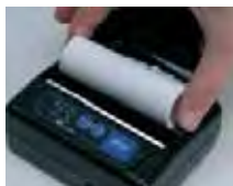
Easy Paper Loading