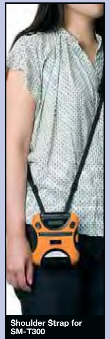
Shoulder Strap for SM-T300