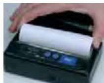
Easy Paper Loading