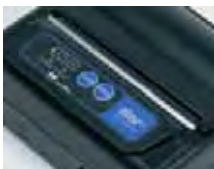
Magnetic Stripe Reader with Serial & Bluetooth

Pocket size 80mm workhorse with an extended battery life of 10 hours with Bluetooth for wireless communication and Serial for printer settings and set-up