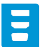
Displayport, HDMI, VGA