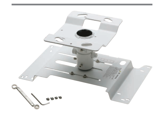
Tailor-made ceiling mount for easy installation and security