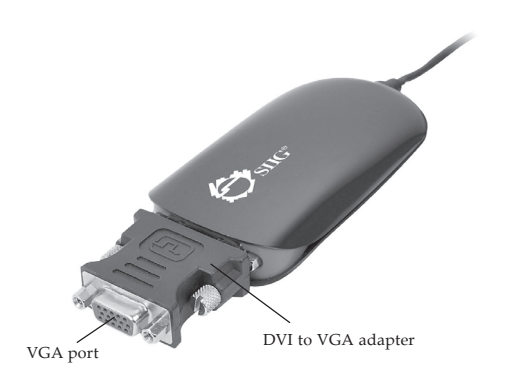
Figure 3: USB to DVI/VGA with DVI to VGA Adapter