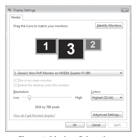
Figure 6: Monitor Orientation

Note : This feature is disabled when your monitors are in Mirror mode.