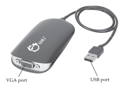
Figure 1: USB to VGA Multi Monitor Video Adapter