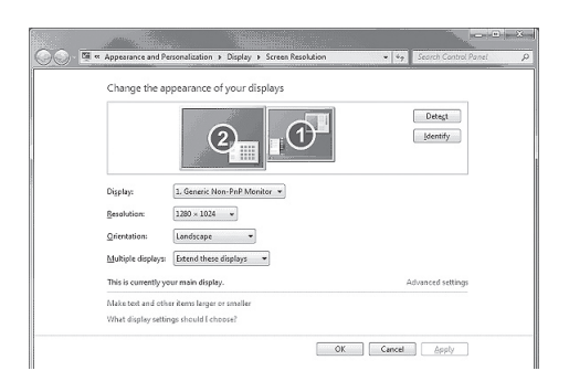
Figure 4: Monitor Orientation

Make this my main display: This setting is active when using your monitors in extended mode only. Before selecting this option, enable Auto Arrange* (right click anywhere on the desktop, click View, click Auto Arrange) to allow your desktop icons to move to the new main display.