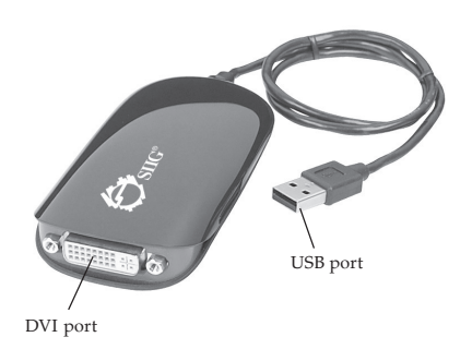
Figure 2: USB to DVI/VGA Multi Monitor Video Adapter