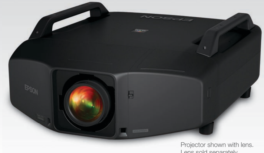
Projector shown with lens. Lens sold separately.