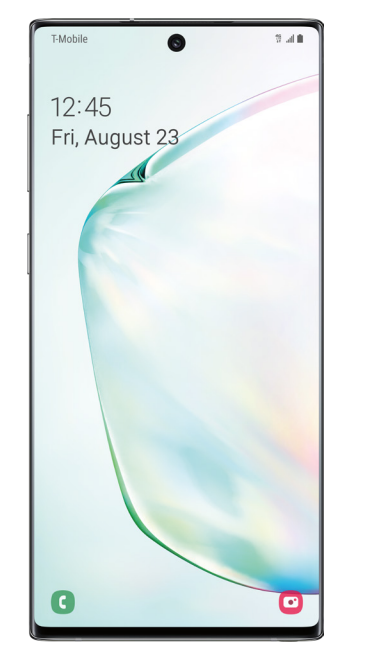
SAMSUNG Galaxy Note10 | 10+