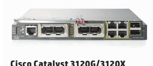
Cisco Catalyst 3120G/3120X