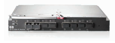
HP Virtual Connect 8 Gb/24-port Fibre Channel Module