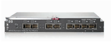
HP Virtual Connect FlexFabric 10 Gb/24-port Module