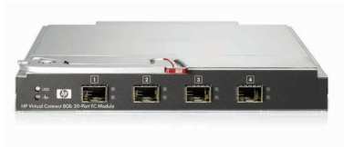
HP Virtual Connect 8 Gb/20-port Fibre Channel Module