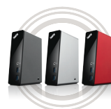
ThinkPad® OneLink Dock One Link, Link it All