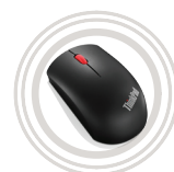
ThinkPad® Optical Wireless Mouse Mouse for All