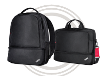
ThinkPad® Essential Line Carry Case Functional & Light Weighted