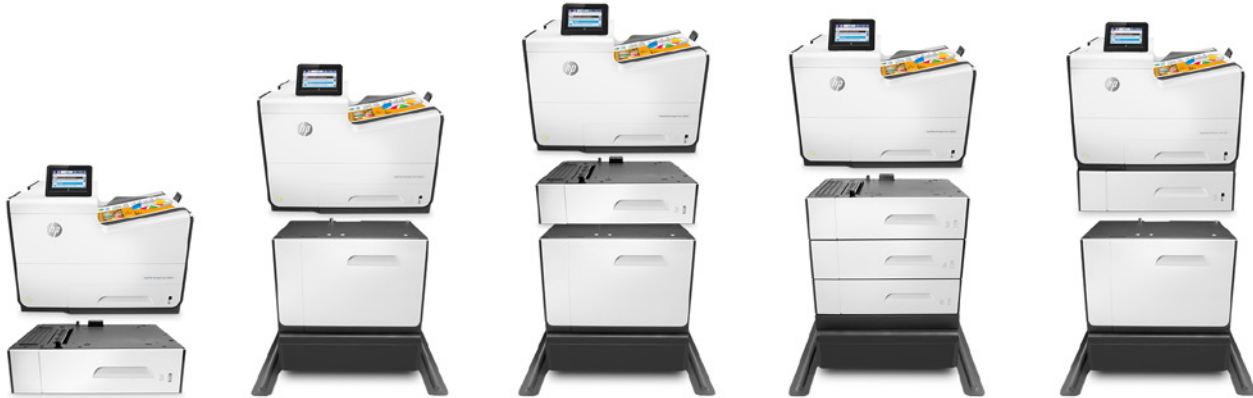
556dn printer; 1x500 sheet feeder (G1W43)