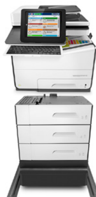
MFP; 3x500 feeder/stand (G1W45A)