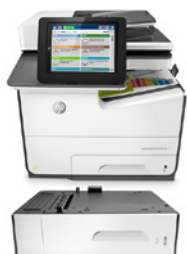
MFP; 1x500 sheet feeder (G1W43)