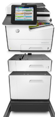
MFP; 1x500 feeder tray 3 (G1W43); cabinet/stand (G1W44)