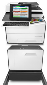
MFP; single cabinet/stand (G1W44A)