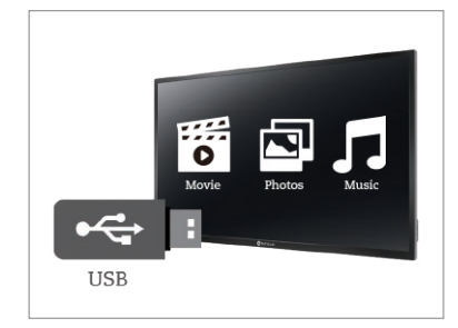
USB Playback for easy multimedia content presenting