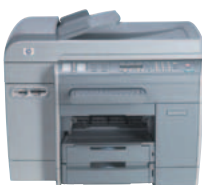
HP Officejet 9130 Printer/Fax/Scanner/Copier