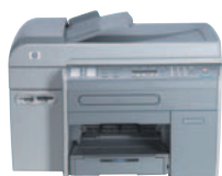
HP Officejet 9110 Printer/Fax/Scanner/Copier

The HP Officejet 9100 All-in-One series is a cost-effective, colour multifunction device offering high-performance printing, faxing, scanning, copying and networking with expandability to document management solutions for small workgroups with high workloads.