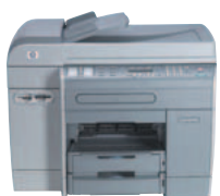
HP Officejet 9120 Printer/Fax/Scanner/Copier