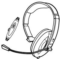
Ear Force XC1 Headset with In-line Controller