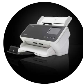
Kodak S2060w/S2080w Scanners