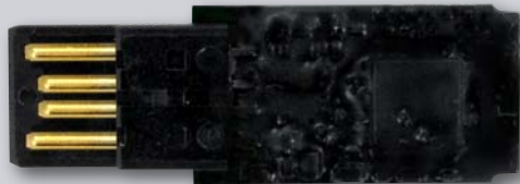
Epoxy Resin Cover Protection