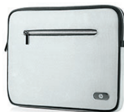
HP 11.6 White Sleeve FOV83AA