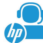
HP Smart Friend 1 Month SVC HG382E

The product could differ from the images shown. © 2013 Hewlett-Packard Development Company, L.P. The information contained herein is subject to change without notice. Specific features may vary from model to model. The only warranties for HP products and services are set forth in the express warranty statements accompanying such products and services. Nothing herein should be construed as constituting an additional warranty. HP shall not be liable for technical or editorial errors or omissions contained herein. All other trademarks are the property of their respective owners.