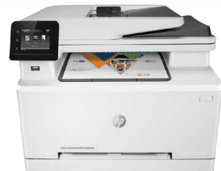
HP Color LaserJet Pro MFP M281fdw