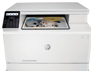
HP Color LaserJet Pro MFP M180nw