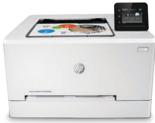
HP Color LaserJet Pro M254dw

If you don't have access to the Internet, contact your qualified HP dealer, or call HP (U.S.) at (800) 282-6672.