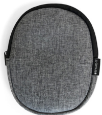
Case for ZūM Prestige Combo™