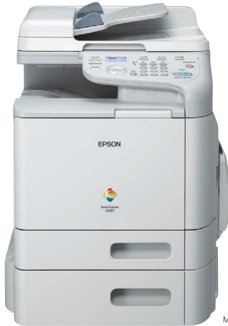
Model shown is the CX37DTNF

The Epson AcuLaser CX37DN series allows medium-to-large workgroups to print in A4 duplex, plus copy and scan in colour and mono, with fax available on the CX37DNF and CX37DTNF models. The series also features an automatic document feeder as standard, while an optional additional paper tray allows workgroups to further improve productivity and save time by quickly and easily increasing paper capacity.