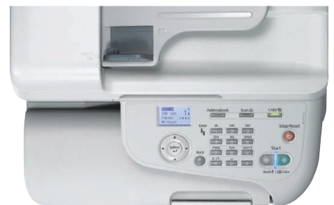
Clear and accessible controls make the AcuLaser CX37DN series easy to use