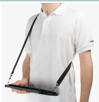
For typing in standing position