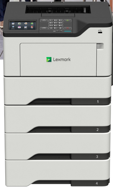
MS622de with optional trays