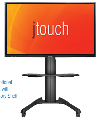
INF6501a on optional Pro Mobile Cart with optional Accessory Shelf

Secure the JTouch to the wall with its standard VESA mounting pattern or mount it on an optional InFocus mobile cart. A mobile cart lets you position it in multiple locations within a room or share it between multiple rooms — wherever it's needed most.