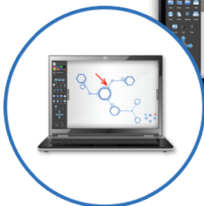
Image shows optional InFocus BigNote whiteboarding software on your PC

JTouch provides multiple ways to display your content, including HDMI, VGA, and wireless via optional InFocus LiteShow adapter. To enable touch, simply connect the JTouch to your computer via USB.