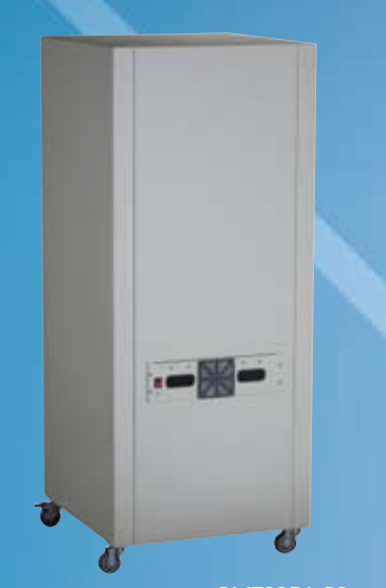
RMT885A-R2: rear view