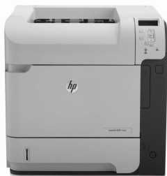
HP LaserJet Enterprise 600 M601dn