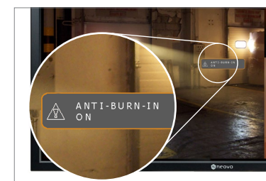
Anti-Burn-in™ technology prevents image sticking