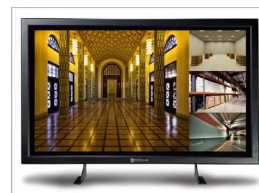
Viewing versatility with Picture-in-Picture (PIP), Picture-by-Picture (PBP) and Video-on-Video (VOV)