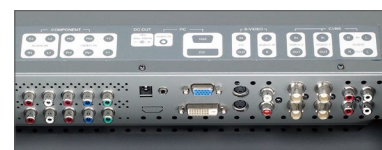
Multiple video inputs (VGA, DVI, dual BNC, S-Video and Component) allow for effortless system integration