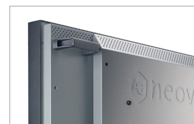
Durable metal casing for enhanced strength and secure mounting